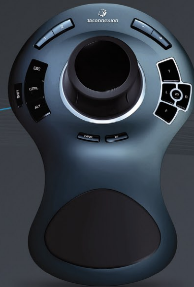
SpaceExplorer™ Professional 3D Mouse