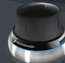
SpaceNavigator™ for Notebooks Portable 3D Mouse