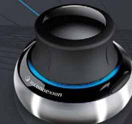
SpaceNavigator™ 3D Mouse

SpacePilot PRO is the ultimate professional 3D mouse, engineered to excel in today's most demanding 3D software environments.