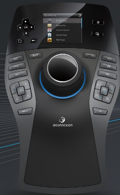
SpacePilot™ PRO The Ultimate Professional 3D Mouse